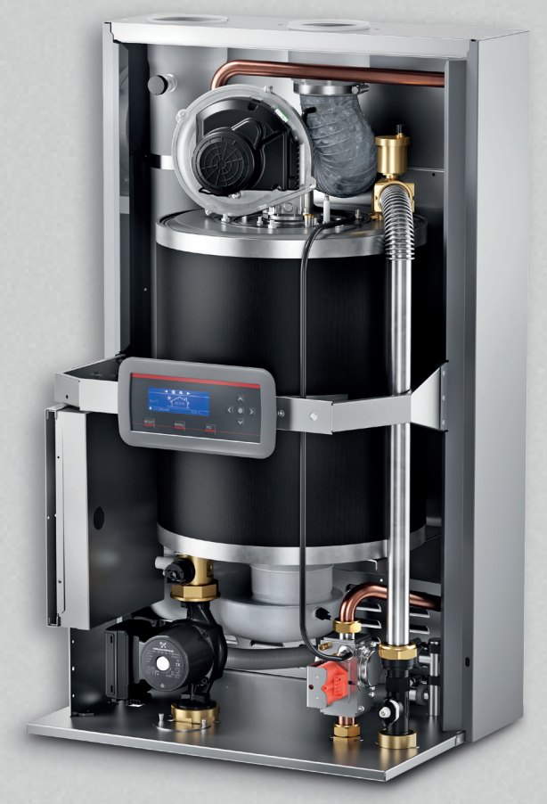
NOTE: this picture is only representative